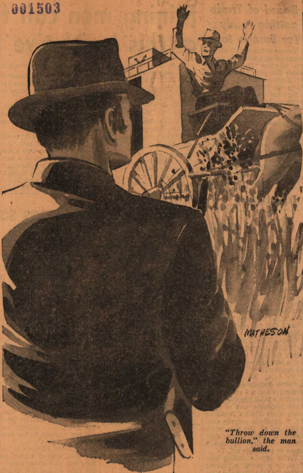
"Throw down the bullion," the man said.